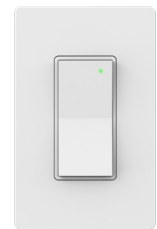
IQ Power Switch PG