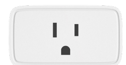
IQ Smart Plug PG